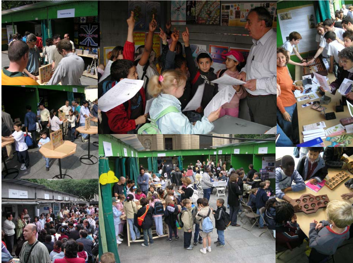
Many events take place during this exhibition: Euromath (European math competition), conferences, mathematical movies, the “Rallye Mathématique dans Paris” and so on.